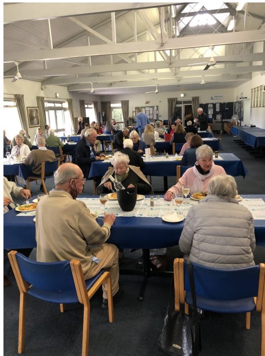
Lunch on 18th September